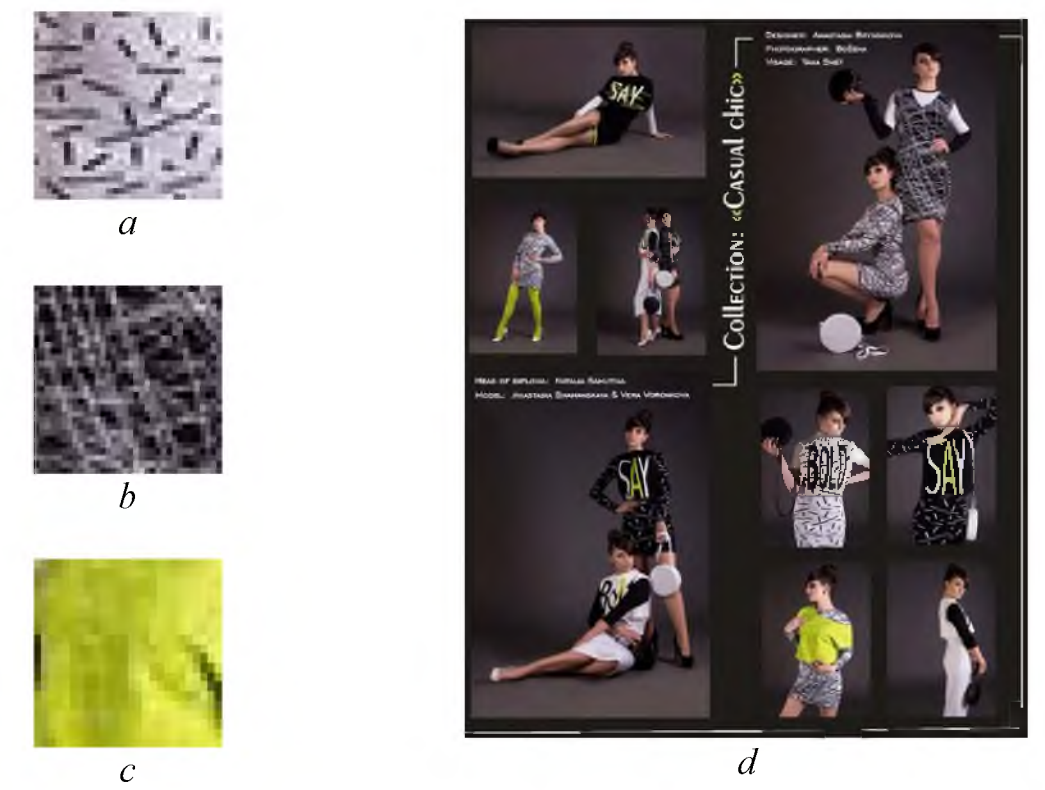
Figure 1 – Author's knitted cloths (a - c) and a clothes collection with their use (d)

Models were sent away during the work practice on LLC «Polesie», Pinsk, the Republic of Belarus. The combination of classical and sports styles brought a youth orientation, an opportunity to carry sets as casual clothes. Models can be produced also by small batches. They are exclusive, stylish, effective, original and quite comfortable that will allow them to be demanded both on national, and international markets.