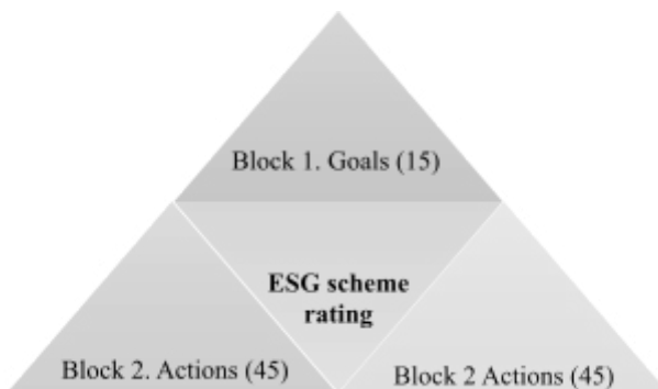
Fig 2. Logic scheme for assigning a rating

The logical scheme for assigning a rating is shown in fig. 2.